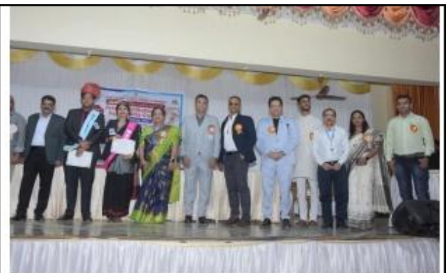
Personality Contest Winners with Dignitaries