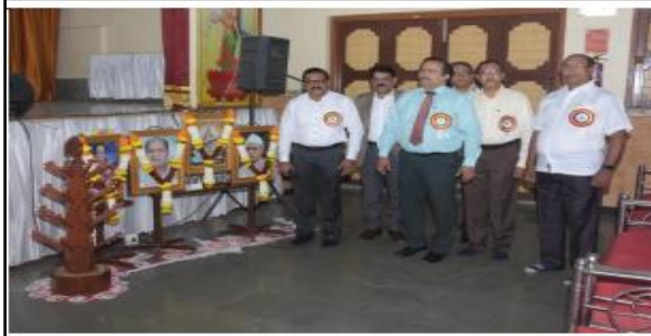
Lighting of the Lamp at the hands of Dignitaries