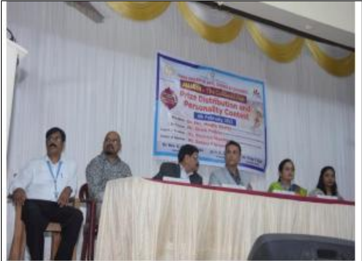
Guests in Prize Distribution Ceremony

Alumni as guest in prize distribution ceremony