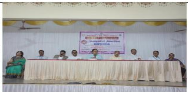
Dignitaries present in the function