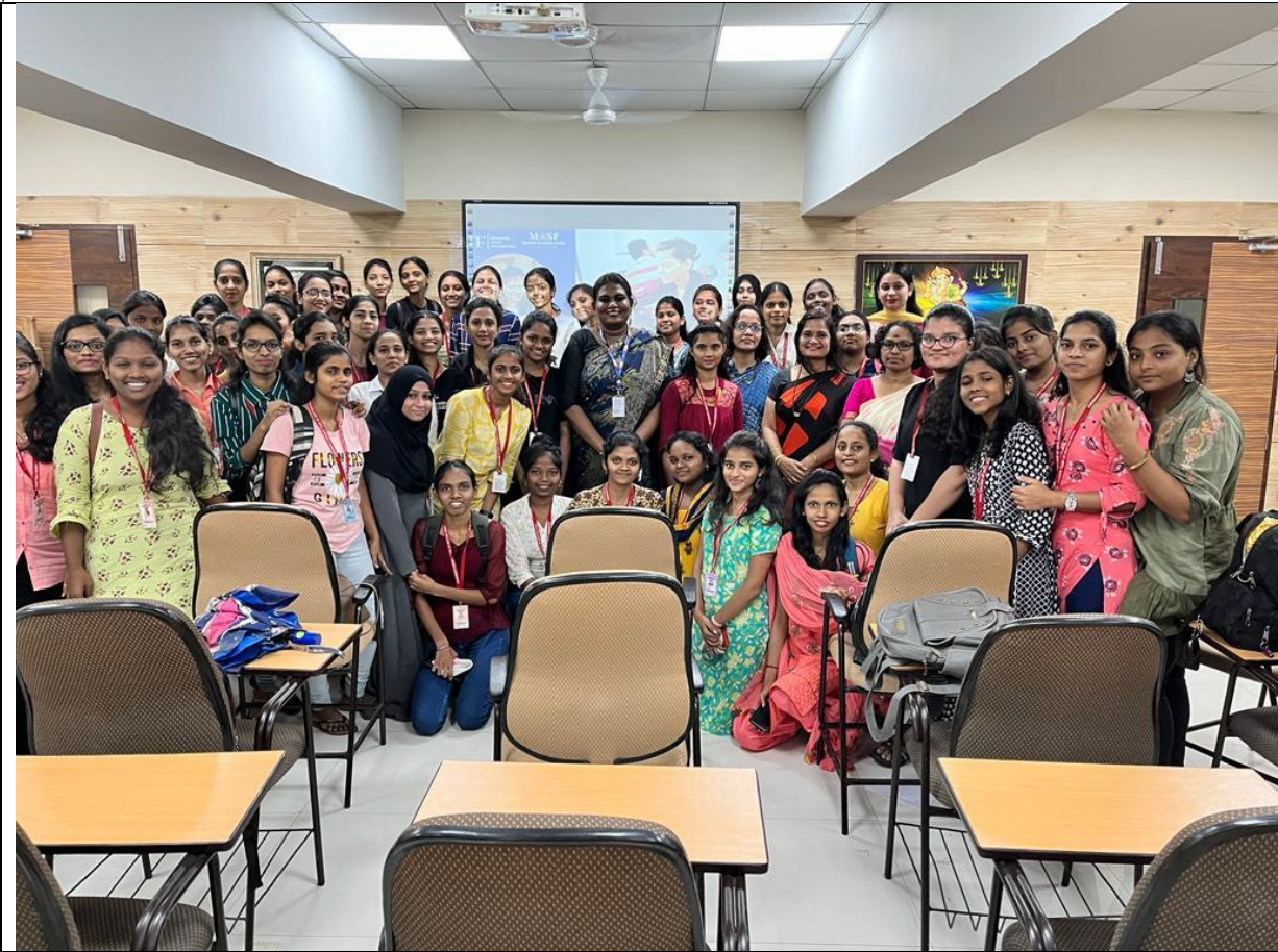
Participants in Workshop