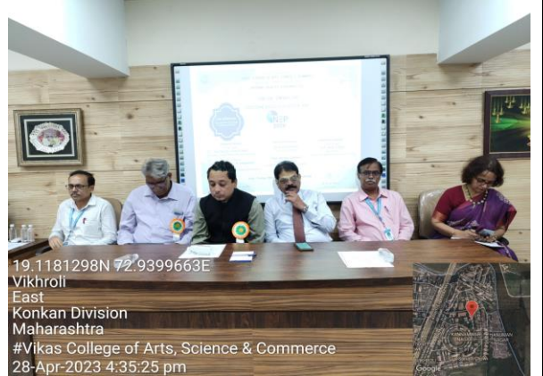
Dignitaries on dias at valedictory function of the seminar.