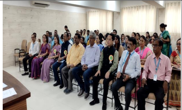
Participants present in seminar